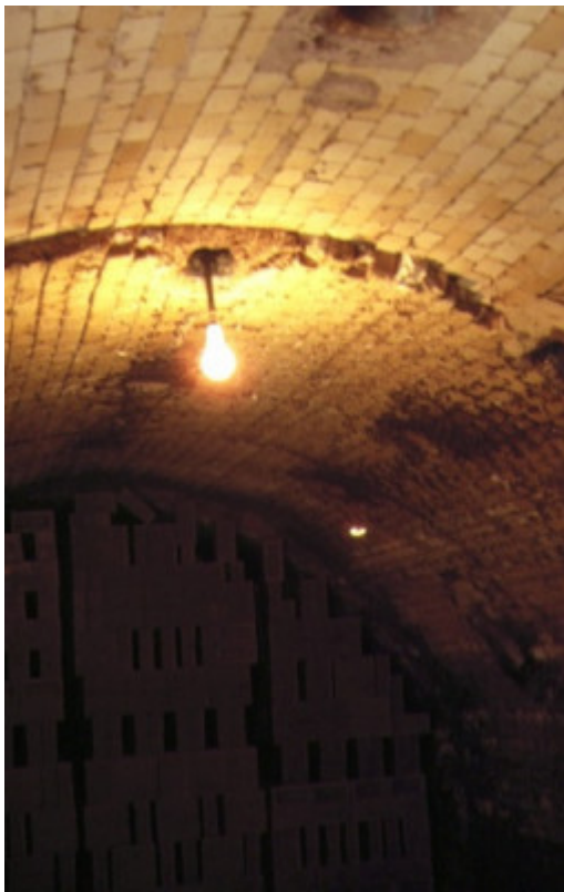
former hoffman brickworks dawson street brunswick vaulted cellar