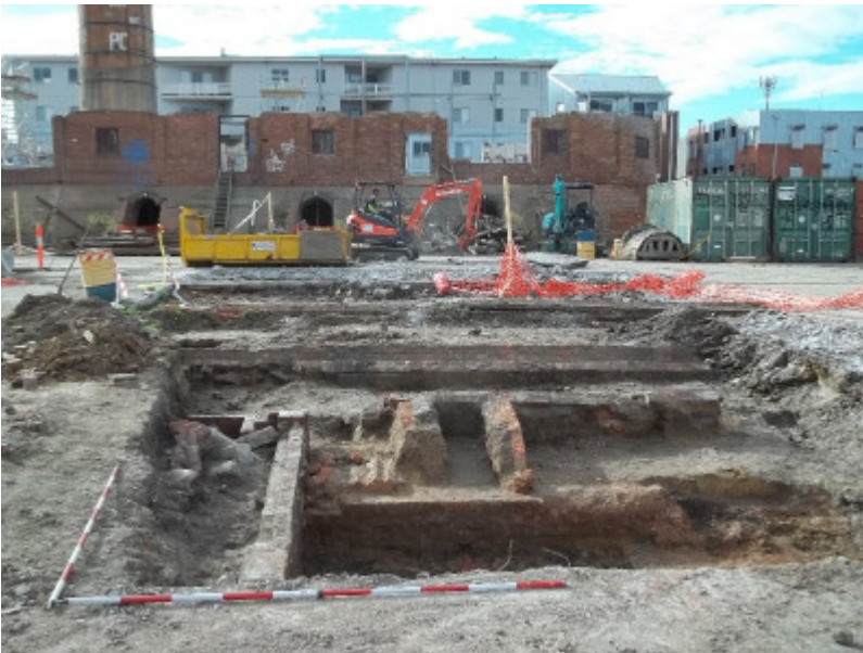
Excavation images 15-18Aug11.jpg