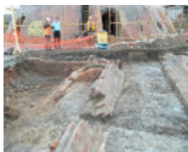
Excavation 15-18Aug11, 1.jpg