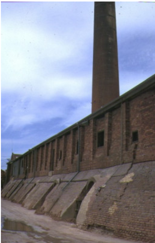
former hoffman brickworks dawson street brunswick side view & chimney