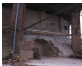
former hoffman brickworks dawson street brunswick storage entrance