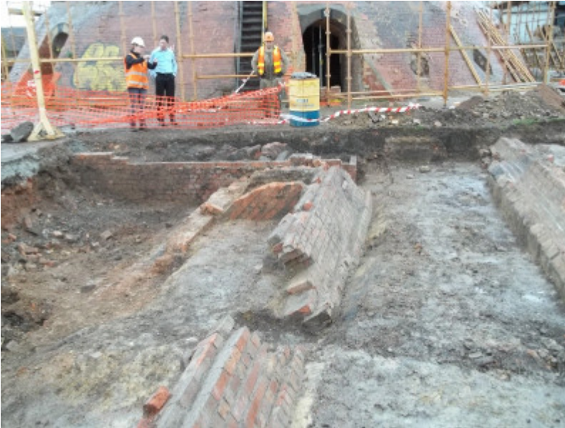
Excavation 15-18Aug11, 1.jpg