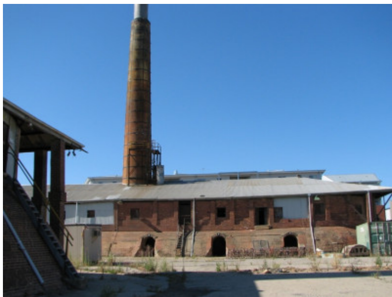
FORMER HOFFMAN BRICKWORKS SOHE 2008