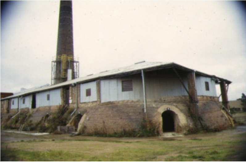
former hoffman brickworks dawson street brunswick front view