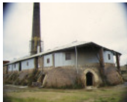
former hoffman brickworks dawson street brunswick front view