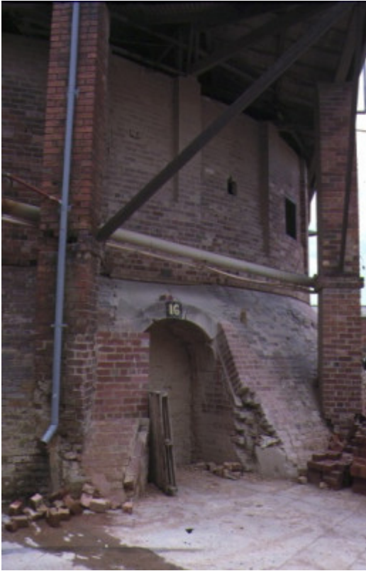
former hoffman brickworks dawson street brunswick storage entrance