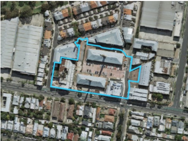
Aerial view of extent of registration