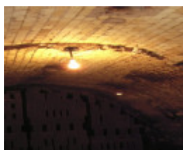
former hoffman brickworks dawson street brunswick vaulted cellar