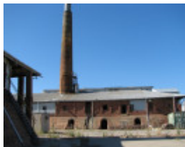
FORMER HOFFMAN BRICKWORKS SOHE 2008