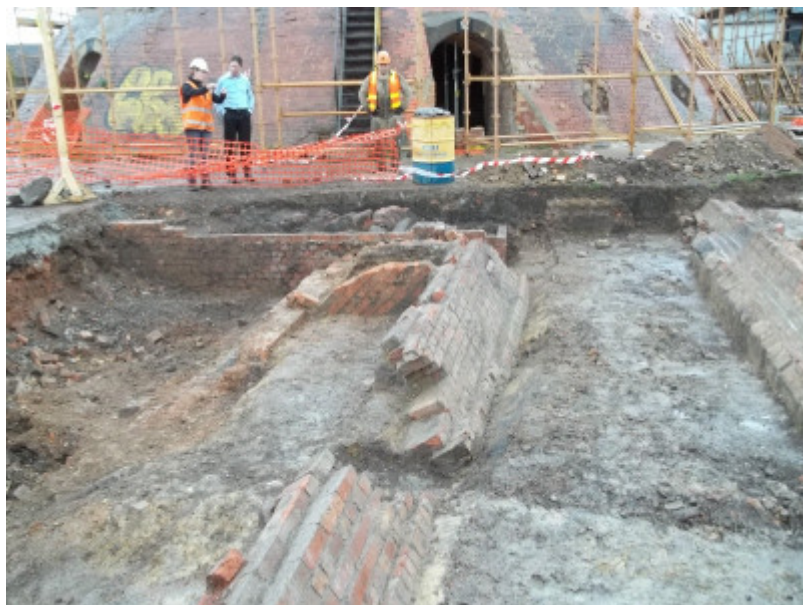
Excavation 15-18Aug11, 1.jpg