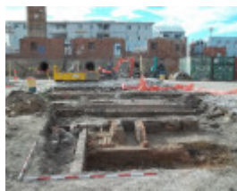
Excavation images 15- 18Aug11.jpg