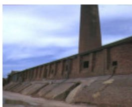
former hoffman brickworks dawson street brunswick side view & chimney