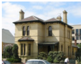
CHRIST CHURCH SOHE 2008