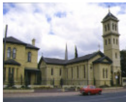
Christ Church Brunswick Front View