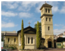
CHRIST CHURCH SOHE 2008