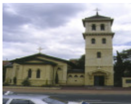
christ church brunswick tower