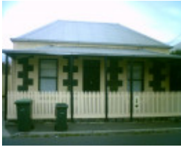
27 Hope Street Geelong West