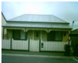
12 Hope Street Geelong West