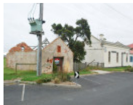
FORMER TURNBULL ORR & CO BOND STORE AND OFFICE SOHE 2008