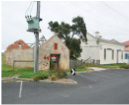
FORMER TURNBULL ORR & CO BOND STORE AND OFFICE SOHE 2008