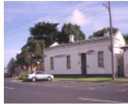
1 bond store & office port albert front view feb1996