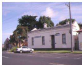
1 bond store & office port albert front view feb1996