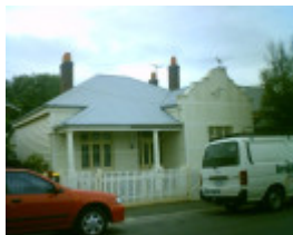
26 Hope Street Geelong West