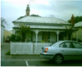
32 Hope Street Geelong West