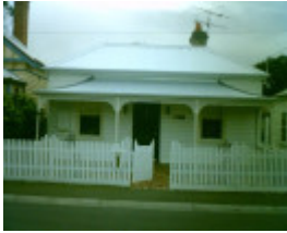
34 Hope Street Geelong West