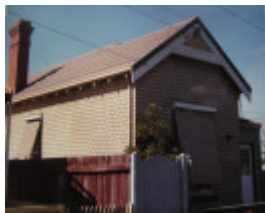
3 Kings Lane, Geelong West