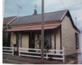
2 Laira Street, Geelong West