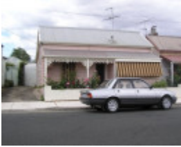
4 Laira Avenue, Geelong West - 2008