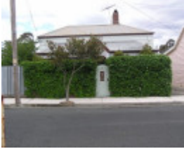
6 Laira Street, Geelong West