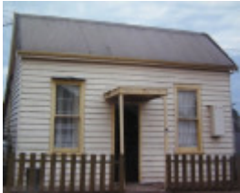
10 Laira Street, Geelong West