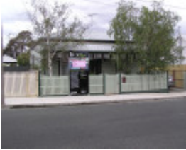
12 Laira Street, Geelong West