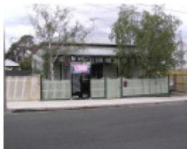
12 Laira Street, Geelong West