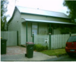
2 Leckie Place, Geelong West