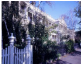
h01291 st vincent place precinct albert park view along street she project 2003