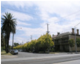
ST VINCENT PLACE PRECINCT SOHE 2008