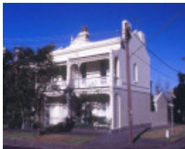
h01291 st vincent place precinct st vincent place albert park view of 99 st vincent place she project 2003