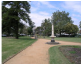
ST VINCENT PLACE PRECINCT SOHE 2008