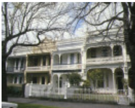
1 st vincent place precinct st vincent place albert park street view 2 sep1976