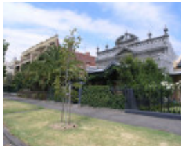
ST VINCENT PLACE PRECINCT SOHE 2008