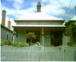
35 Lupton Street, Geelong West