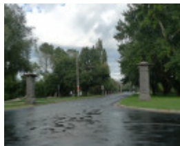
1761_Ballarat Botanic Gardens_19 March 2010