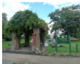
1761_Ballarat Botanic Gardens_19 March 2010