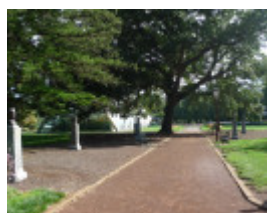
1761_Ballarat Botanic Gardens_19 March 2010