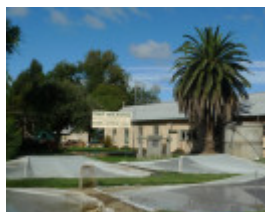
1761_Ballarat Botanic Gardens_19 March 2010