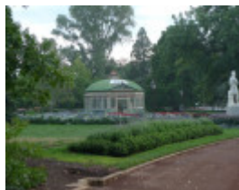
1761_Ballarat Botanic Gardens_19 March 2010