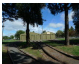
1761_Ballarat Botanic Gardens_19 March 2010