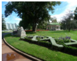
1761_Ballarat Botanic Gardens_19 March 2010