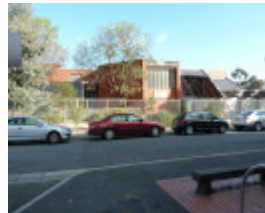
Vere St 49 812.JPG