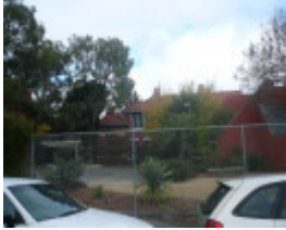
P1280778 49 Vere.JPG