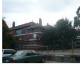
P1280779 49 Vere.JPG