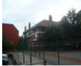
P1280780 49 Vere St.JPG