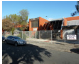
Vere St 49 813.JPG