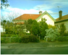
3 O Connell Street, Geelong West