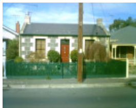
23 O'Connell Street, Geelong West