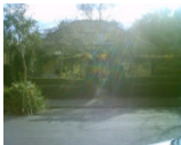
24 O'Connell Street, Geelong West