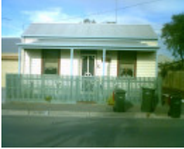
27 O'Connell Street, Geelong West