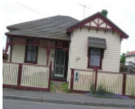
35 O'Connell Street, Geelong West