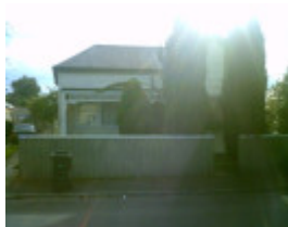
62 O'Connell Street Geelong West