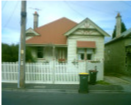
63 O'Connell Street Geelong West