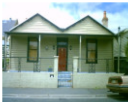
1 Pizer Street, Geelong West