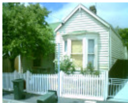
5 Pizer Street, Geelong West