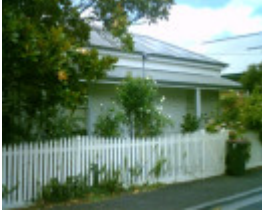
4 Potter Street, Geelong West