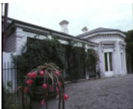
glenara glenara road bulla garden terrace dec1983