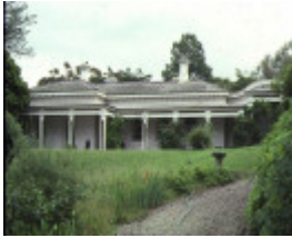
1 glenara glenara road bulla front view dec1983