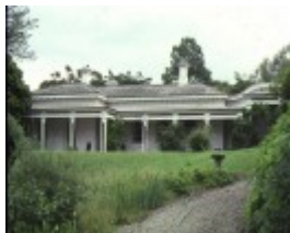
1 glenara glenara road bulla front view dec1983