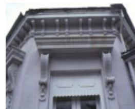
glenara glenara road bulla drawing room bay exterior dec1983