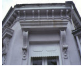
glenara glenara road bulla drawing room bay exterior dec1983