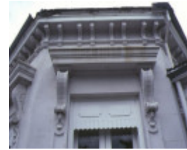
glenara glenara road bulla drawing room bay exterior dec1983