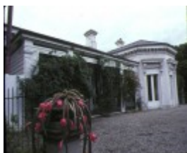
glenara glenara road bulla garden terrace dec1983