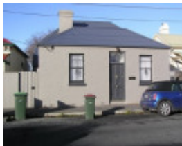
11 Preston Street, Geelong West