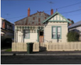
19 Preston Street, Geelong West