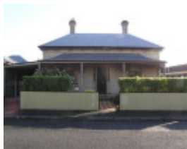
28 Preston Street, Geelong West