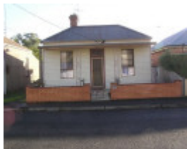
32 Preston Street, Geelong West