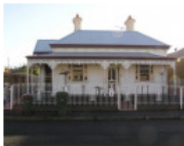
36 Preston Street, Geelong West