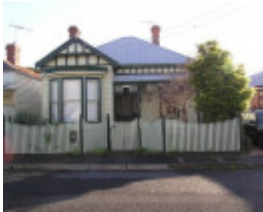
42 Preston Street, Geelong West