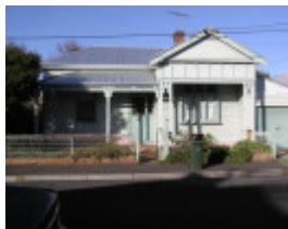
43 Preston Street, Geelong West