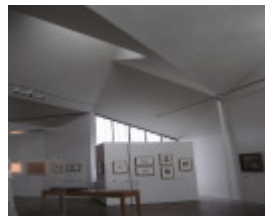
Benalla Art Gallery Interior May 2012.JPG