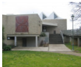
Benalla Art Gallery Aug 08_6.jpg