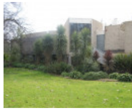
Benalla Art Gallery Aug 08_9.jpg