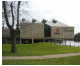
Benalla Art Gallery Aug 08_4.jpg