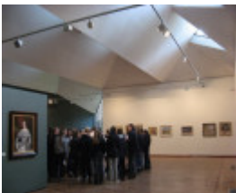
Benalla Art Gallery Interior May 2012.JPG