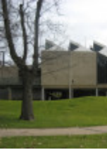
Benalla Art Ga