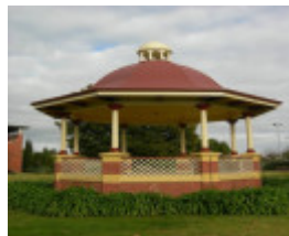
1772_Benalla_Botanic_garden: 1772_Benalla_Botanic_garden: 1772_Benalla_Botanic_garden: