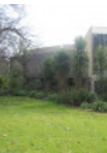
Benalla Art Ga