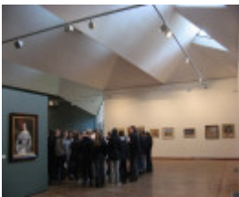
Benalla Art Gallery Interior May 2012.JPG