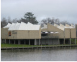
Benalla Art Gallery Aug 08_1.jpg