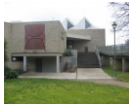
Benalla Art Gallery Aug 08_6.jpg