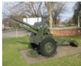
1772_Benalla_Botanic_garden: 1772_Benalla_Botanic_garden: 1772_Benalla_Botanic_garden: