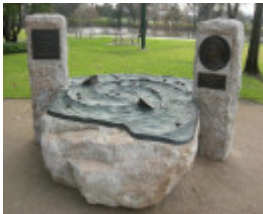
1772_Benalla_Botanic_garden: 1772_Benalla_Botanic_garden: 1772_Benalla_Botanic_garden: