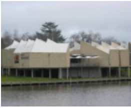
Benalla Art Gallery Aug 08_1.jpg