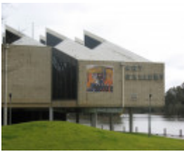
Benalla Art Gallery Aug 08_5.jpg