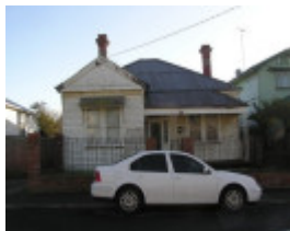
48 Preston Street, Geelong West