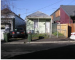
51 Preston Street, Geelong West