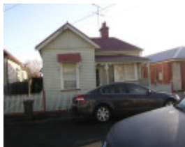
63 Preston Street, Geelong West