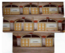
Mining Exchange_4