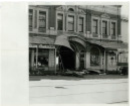
Mining Exchange_Streetscape_1