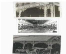
Mining Exchange_1_c1901