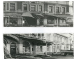
Mining Exchange_Streetscape_3