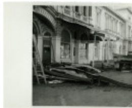
Mining Exchange_Streetscape_2