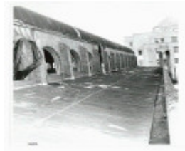
Mining Exchange_Roof_2_1976