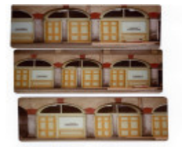
Mining Exchange_3