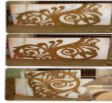
Mining Exchange_Iron works_1