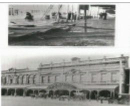
Mining Exchange_Streetscape_4