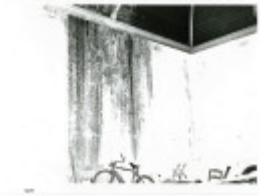
Mining Exchange_Hall_1_1976