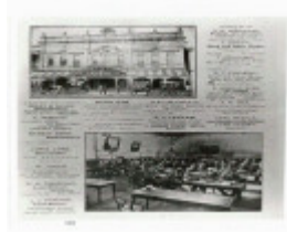
Mining Exchange_Evening Echo_1904