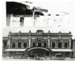
Mining Exchange_Streetscape_5