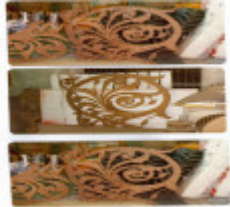
Mining Exchange_Iron works