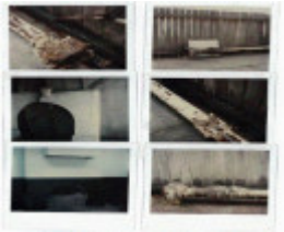
Mining Exchange_Iron works_2