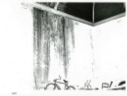
Mining Exchange_Hall_1_1976