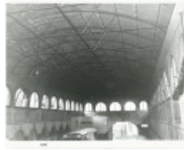
Mining Exchange_Hall_1976