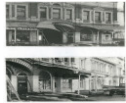
Mining Exchange_Streetscape_3