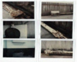
Mining Exchange_Iron works_2