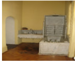
Fortuna_Bendigo_marble bathroom_3 August 2009