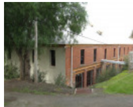
Fortuna_Bendigo_battery_3 August 2009