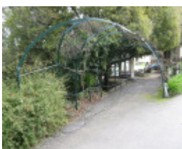
Fortuna_Bendigo_gardebour_3 August 2009