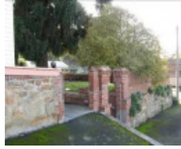
Garden wall (F3) south-east of house.jpg