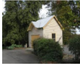
Coach housegarage (B5).jpg