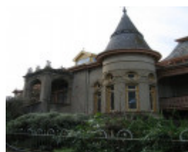
Fortuna_Bendigo_west side_3 August 2009