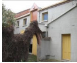
Stable & coach house (B2).jpg