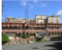
Fortuna_Bendigo_east elevation_3 August 2009