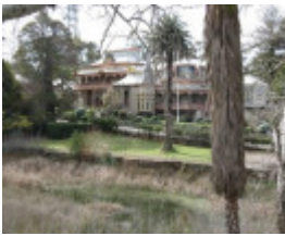
Fortuna Villa 2012 Looking across the lake north-east towards the house .jpg