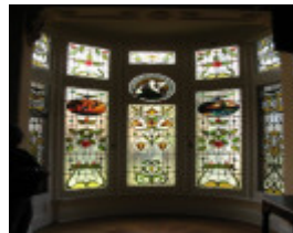
Fortuna_Bendigo_stained glass_3 August 2009