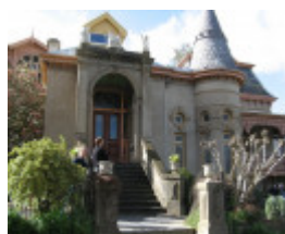
Fortuna_Bendigo_main entrance_3 August 2009