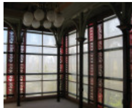
Fortuna_Bendigo_conservatory interior_3 August 2009