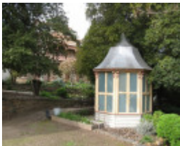
Fortuna_Bendigo_summer house_3 August 2009