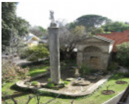
Fortuna_Bendigo_Pompeii Fountain_3 August 2009