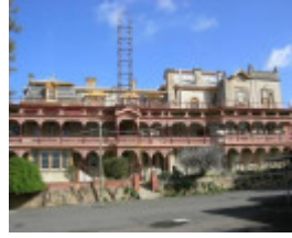
Eastern elevation of the house .jpg