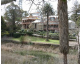
Fortuna_Bendigo_looking over lake_August 09