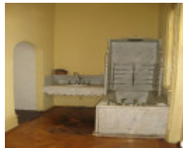
Fortuna_Bendigo_marble bathroom_3 August 2009