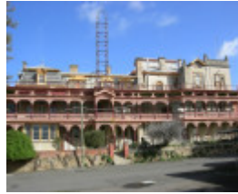
Fortuna_Bendigo_east elevation_3 August 2009