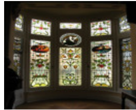
Fortuna_Bendigo_stained glass_3 August 2009