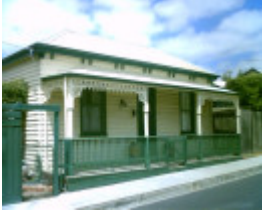
4 St James Street, Geelong West