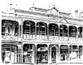
Old Colonists Hall 16-24 Lydiard St - Film 1 /Frame 21 - Ballarat Conservation Study, 1978