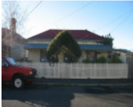
2 Tayler Street, Geelong West