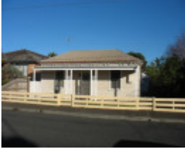
3 Tayler Street, Geelong West