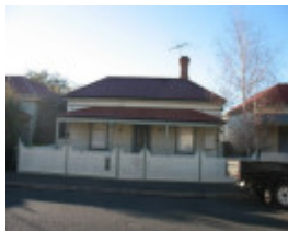
4 Tayler Street, Geelong West