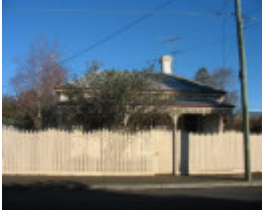
5 Tayler Street, Geelong West