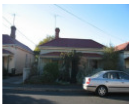
6 Tayler Street, Geelong West